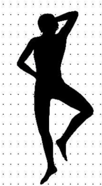
Figure 2. Microwave Targeting. A grid pattern of microwave shots or “bullets” is used and the reflected signal tells them exactly where you are and how you are positioned. Your body is mostly water – and this has a unique reflected signal. Your brain will emit a unique frequency that identifies you among a crowd of people that are being hit with microwaves. This grid scan can be done in a matter of seconds using the satellite, and is particularly easy if the target is still or sleeping. It even works thru many stories in an apartment building – because the reflected signal is very unique when it hits a person. If a mylar sheet is placed above the person, you can actually hear the microwave shots hitting the mylar sheet. (a microphone recording can be made this way with the sound amplified.) The satellite's tracking signal can shoot more than 20 times per second – and the frequency is about 3600 to 3750 MHz. They can track many people at the same time with one satellite. No tracking chip implant is needed.