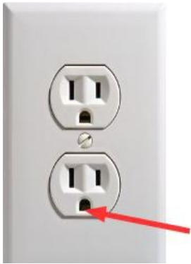
Figure 1. Ground a wire to the bottom hole in a 3-prong outlet. Use some tape to hold it in place. One method is to stick the loose end under the elastic in your underwear, or connect the ground to a piece of aluminum foil that is touching your bare skin.